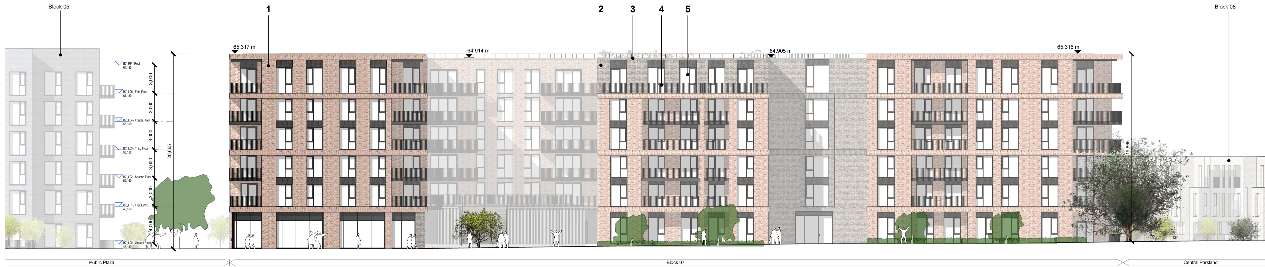
North Elevation 1 : 200