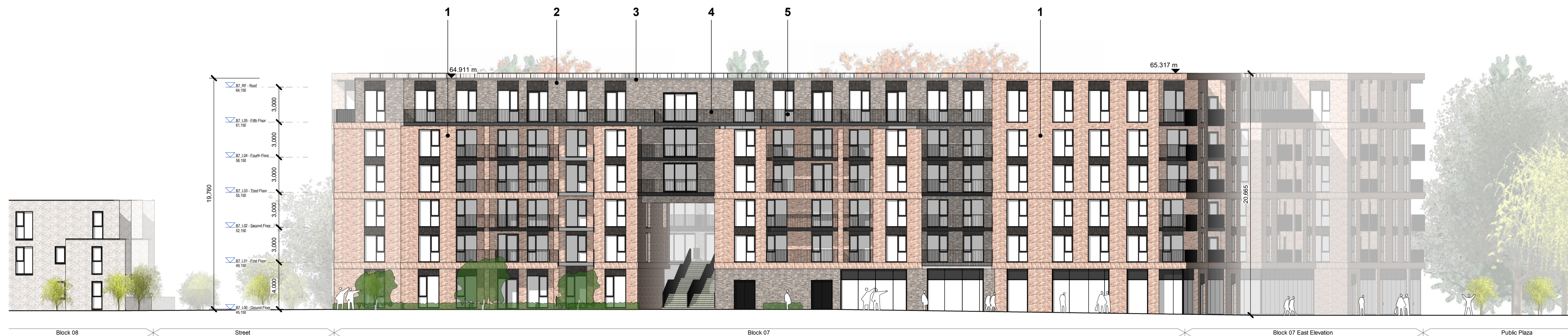
South Elevation 1 : 200

Notes: - Do not scale from this drawing. Use figured dimensions in all cases. - Verify dimensions on site and report any discrepancies to the Architect immediately. - This drawing is to be read in conjunction with the Architect's Specification. - © This drawing is copyright and may only be reproduced with the Architect's permission.